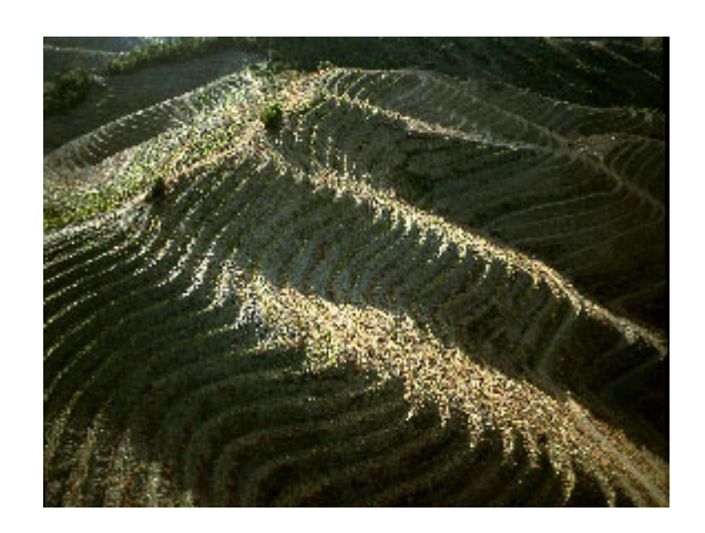
WE'LL VISIT OUR SPECTACULAR VINEYARD AND WINERY IN PRIORAT